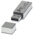
USB memory stick, 8 GB

USB memory stick - USB FLASH DRIVE - 2402809